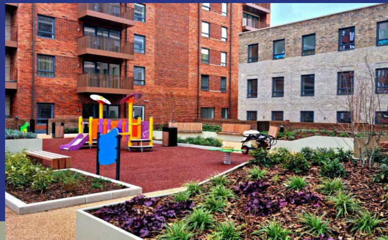
Family-friendly spaces readied for the community